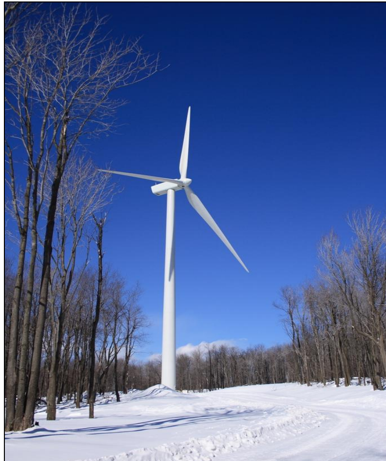
Figure 3-1: Photograph of a typical turbine

Figure 3-1 is a picture of a typical turbine. Figure 3-2 is a cut-away diagram of a turbine: