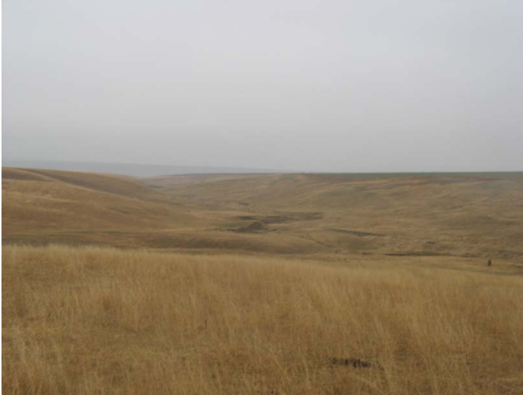
Figure 4 2: View of the area of proposed turbines B6-B10

The landscape character is judged of moderate importance and sensitivity and impacts low to moderate.