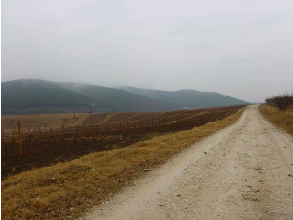
Figure 2-2: View south from existing track near Turbine A5 looking towards Allah Bair Hill – the site is designated a Site of Community importance (SCI)