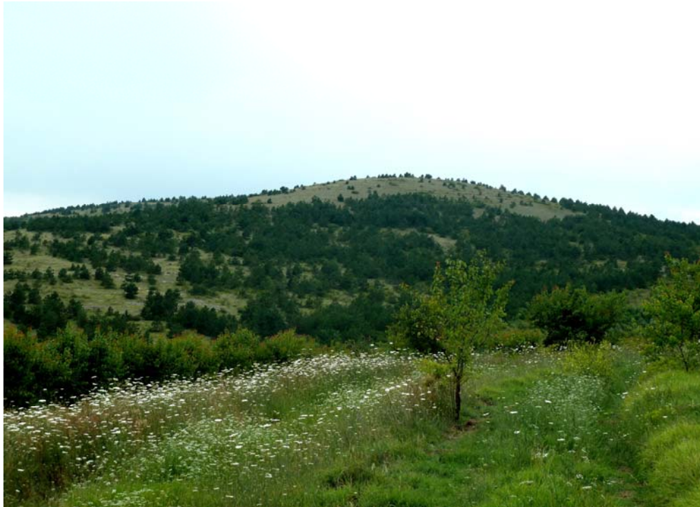
Figure 4 1: View of the area around proposed turbines A1-A12: the turbines will be located both in the foreground and on the hill

The turbines will be on a hill that comprises a mixture of agriculture (arable, orchards and vineyard), steppe grassland and tree belts.