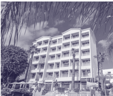
Through organisational re-structuring we helped Estella Hotel & Apartments to boost its labour productivity by 12 per cent.

The company’s competitive advantage was friendly personnel and superior customer service. Although the hotel