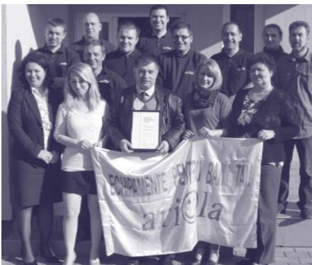
Employee development has resulted in improved sales.

As the machines must be checked 1-3 times a week, the service department is Ariola's largest, bringing in 30% of revenues and the highest margins. In this very dynamic market where client