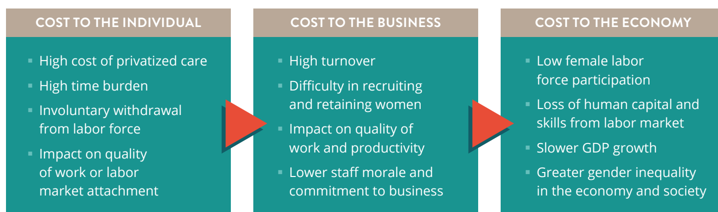
FIGURE 1. The Costs of Not Resolving Care Needs

to care for others or work in the informal economy are less likely to accumulate pensions and social security and be protected against poverty in older age. The costs to businesses from the lack of access to quality care services are also substantial. When women leave the labor market, firms can face high turnover rates, which impact the quality of work and productivity. The challenges of balancing care and work responsibilities can lower morale and create inevitable tensions at