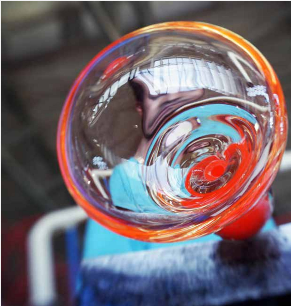
Glass-making at one of Şişecam's production facilities in Turkey.