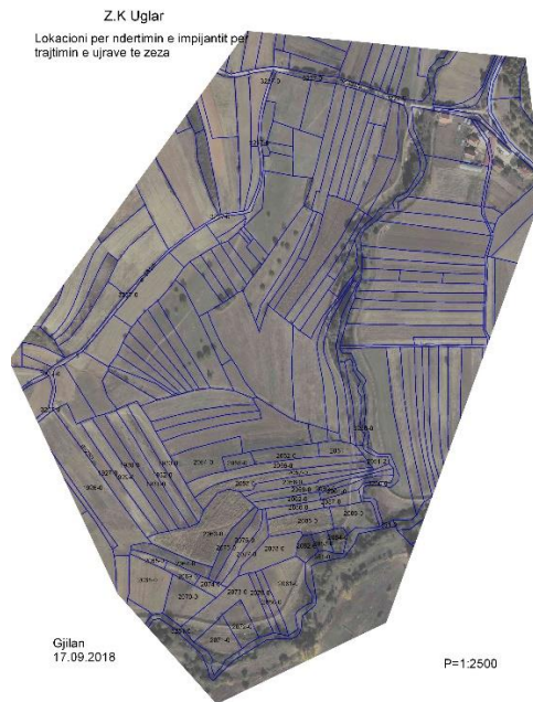
Figure 1-2. Affected land parcels at the WWTP site