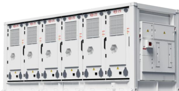
Figure 3-3 - BYD BESS Unit

Figure 3-3 shows an example of a BYD BESS unit such as those to be installed at the Turośń Project.