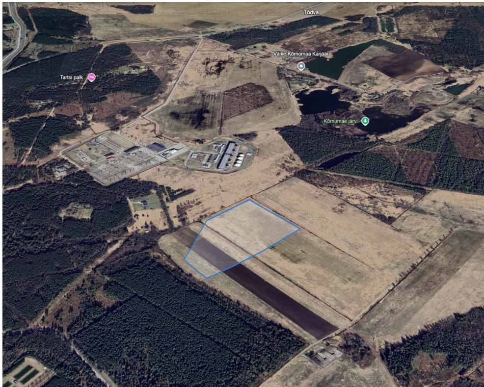
Figure 1 - Approximate Hertz I Site Boundary and Setting

BSP is developing the Battery Energy Storage System (BESS) plant, Evecon Solar 461 OÜ (“Hertz I” or the “Project”) in Harju County, Estonia.