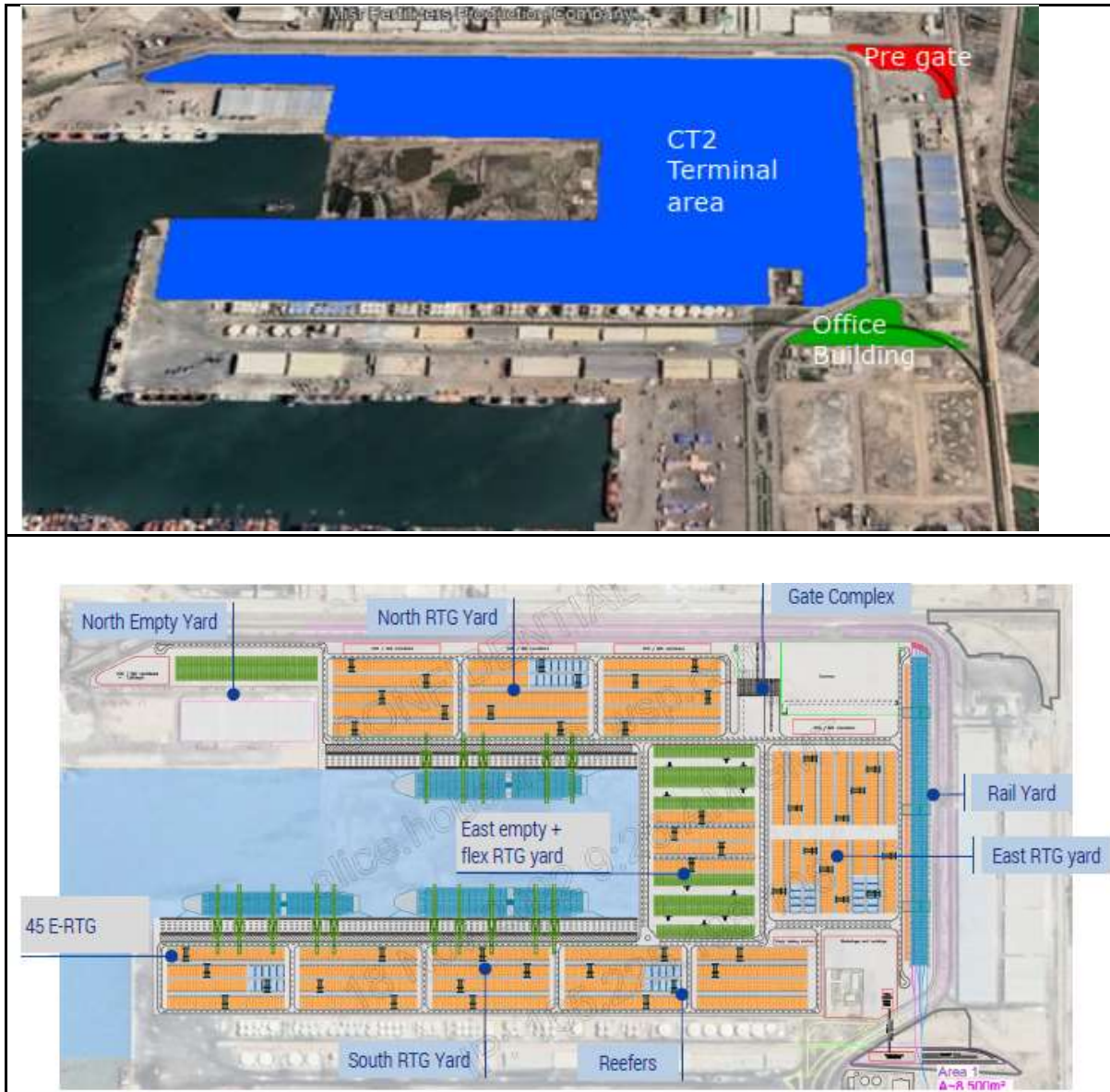
Figure 2 – Overview and Design of the Terminal Layout

The northern side of the terminal will be constructed alongside additional land units over an area of 93 ha to accommodate terminal area as well as office building and pre gate complex (Figure 2).