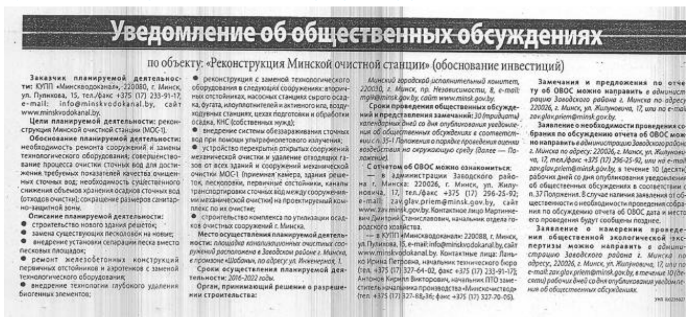
Figure 4.1 Notification of public consultations in 'Minsky kuryer' newspaper

Source: Excerpt from 'Minsky kuryer' newspaper, October 14 th , 2015