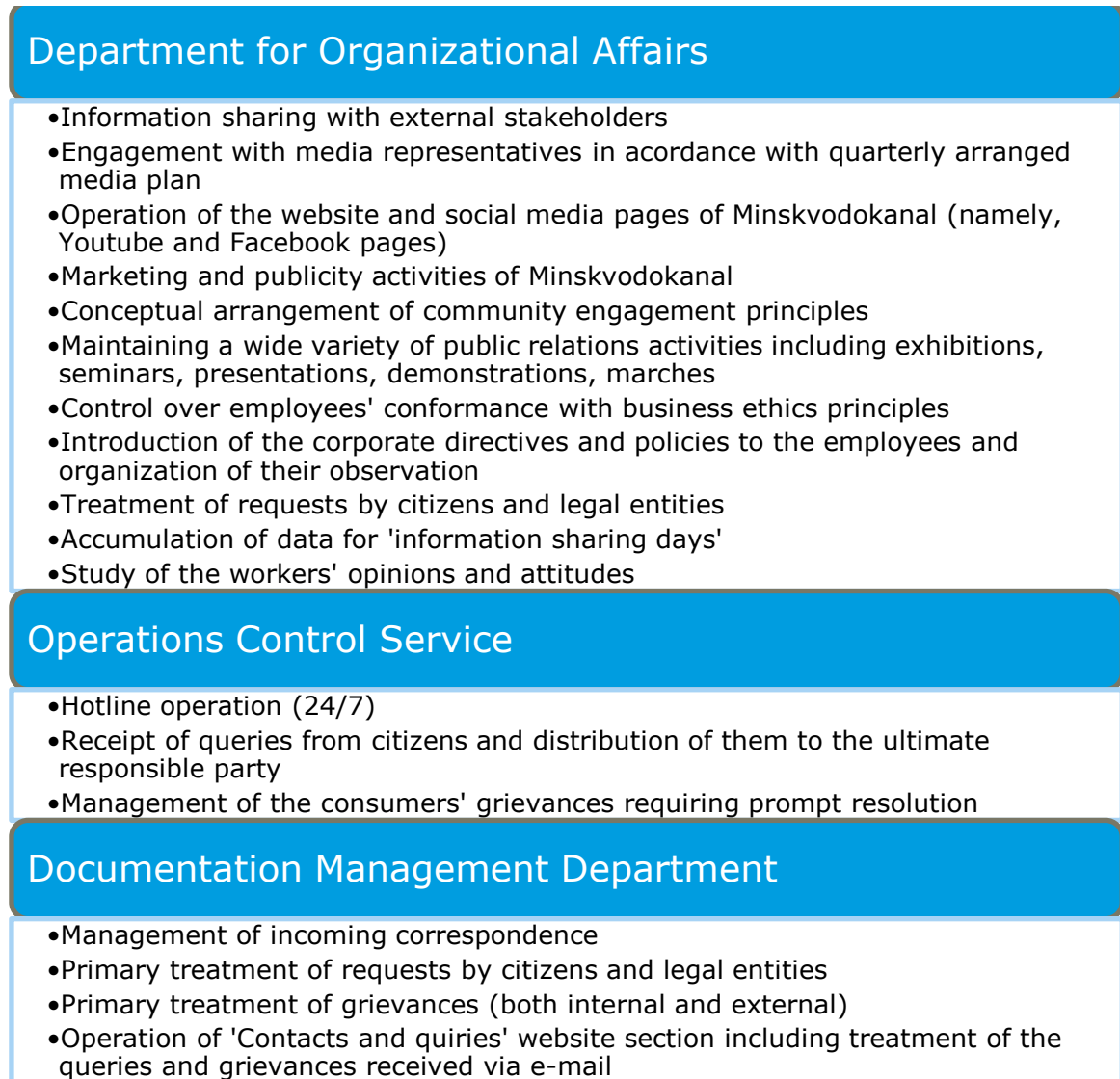
Figure 3.1 Departments of UE "Minskvodokanal" involved into stakeholder engagement

The human resources are distributed among the three divisions as follows: