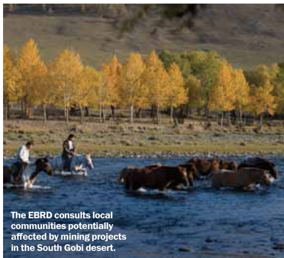
The EBRD consults local communities potentially affected by mining projects in the South Gobi desert.

Achieving sustainable development requires transparent and inclusive decision-making processes.