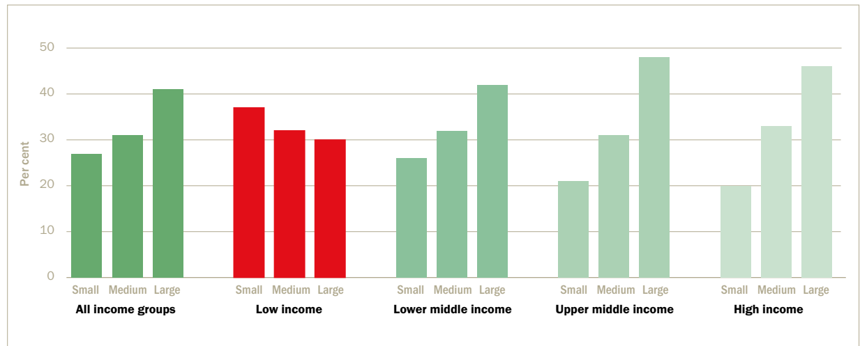
Figure 1. Share of employment by firm size and country income group