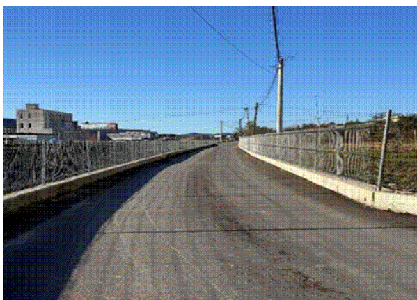
Figure 2: Photo completed of ancillary road in Bexull, January 2026

In January 2026, IPAM conducted a final monitoring visit to verify completion of the access solution. The ancillary road was fully constructed and functional for vehicular traffic, and the underpass near the mosque was confirmed by both the Client and Requesters to be serving pedestrians and small vehicles as intended. IPAM verified that the temporary arrangement, the continued use of the level crossing, had remained in place until the permanent solution became operational. The team also confirmed that the landowners who were due to receive compensation due to the partial expropriation of their land were informed that the documents were submitted to the Council of Ministers. However, they noted their understanding that the compensation process and amount is out of scope of IPAM's work. The visit also confirmed continued communication between the Parties and that the commitments under the Problem Solving Agreement had been substantially fulfilled.