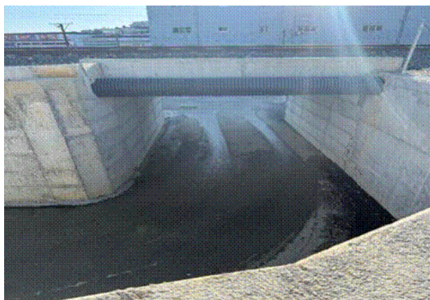
Figure 3: Photos of the underpass in Bexull, January 2026