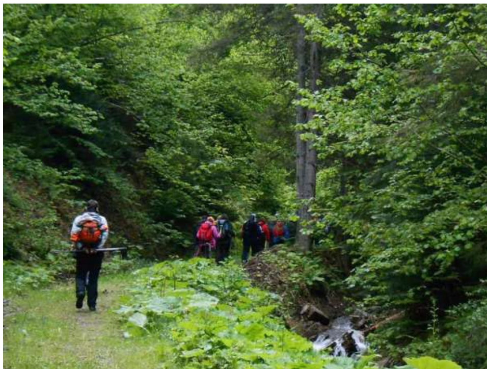
Vrući potok after: