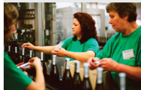
Supporting activities across the production chain