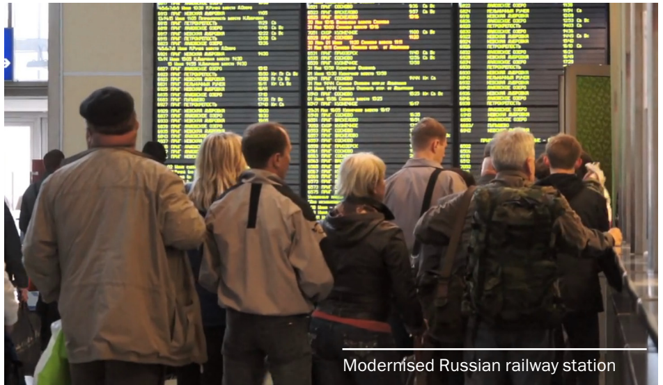
Modernised Russian railway station

The EBRD is supporting the Turkish government in its efforts to meet growing electricity demand and diversifying away from expensive imported fuel sources by stimulating investment in renewable energy. In this context, the EBRD is providing a €100 million senior loan to Enerjisa, a leading Turkish energy company. Enerjisa will use the funds for the construction of a 142.5 MW onshore wind farm located in Balikesir in western Turkey. With 52 2.75 MW turbines, the wind farm will be the largest in the country. The forecast output of 210 TWh/year is equal to 0.2 per cent of total generated electricity in Turkey in 2010.