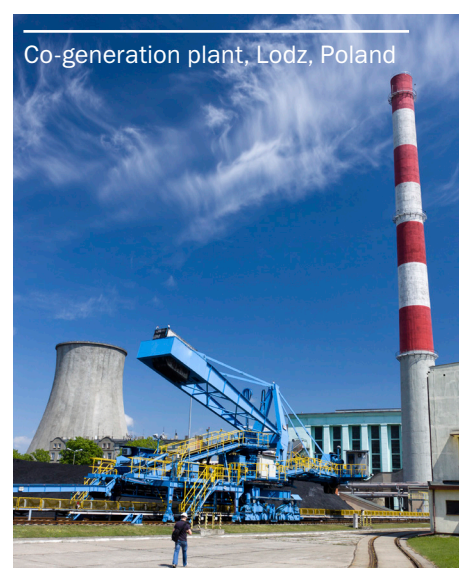
Co-generation plant, Lodz, Poland

*Every euro spent on technical assistance and grants mobilises the above volumes of sustainable energy investments.